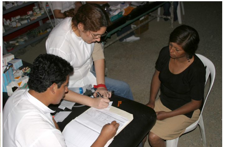
Camp MAPFRE provides food, clothing, clinic, social workers and a cafeteria