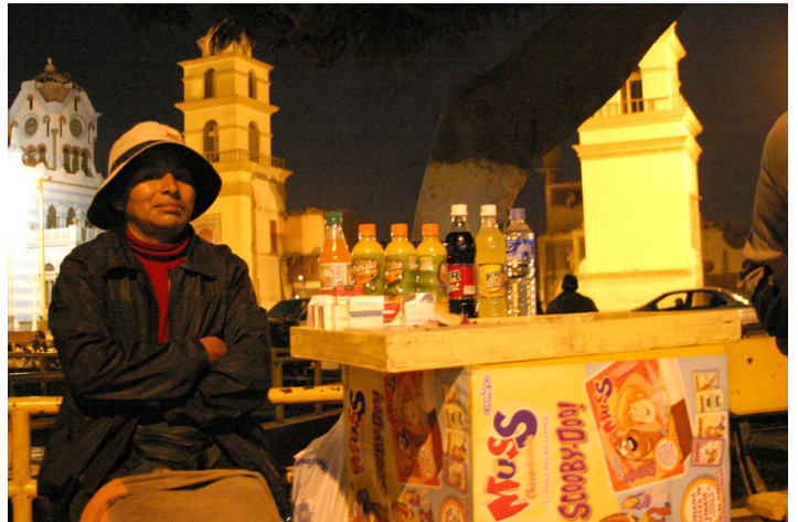
On one of the towers it's painted 148 to remember all who died. At the main plaza a woman set up her business stand selling drinks, candies and cigarettes.