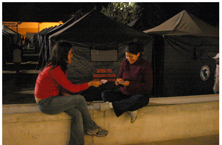
PISCO PRIDE! "There is only one PISCO" Several women play cards inside one of the tent cities the Peruvian government set up in Pisco.