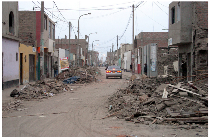
Pisco City. Destruction is seen all over the place. Few homes are still standing and many that survived have cracks in their walls. 85% of Pisco was destroyed.