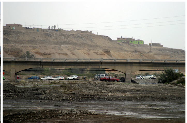
Near Pisco, children chase the buses for food, water and whatever they give them. The main bridge was damage and cars and trucks must go around a temporary road.