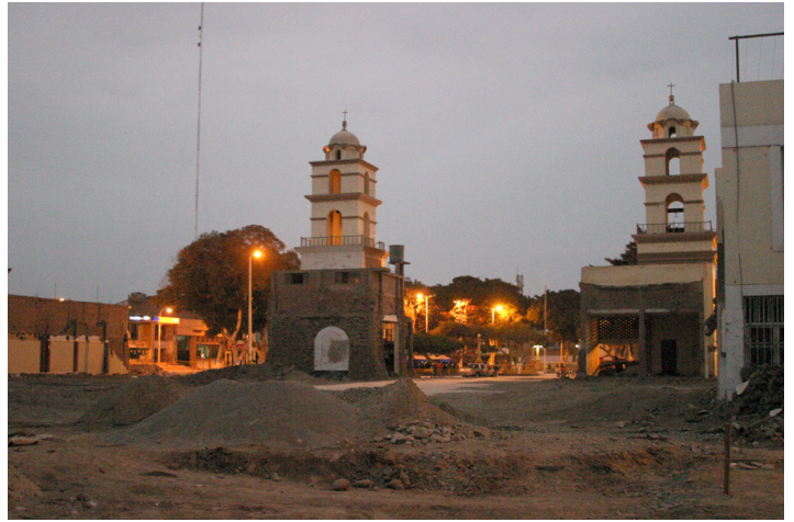
148 people died during mass at the main Catholic Church in Pisco. The bell towers are the only structure of the church still standing. Left photo is taken from outside. Right photo is taken from what would have been inside the church looking at the main plaza.