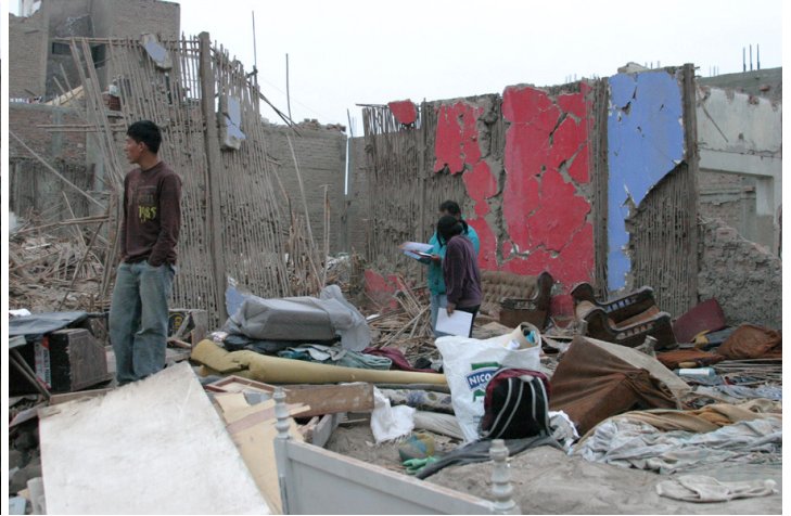
Peruvian soldiers stand guarding most of streets in Pisco. Two weeks later, victims continue to look for their belongings and saving what they can.