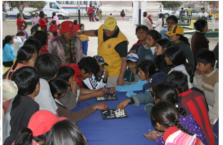
At a park near Pisco children are entertained with clowns and games. A mobile library was set up at the park. In some areas children go to school at the main plazas or shelters.